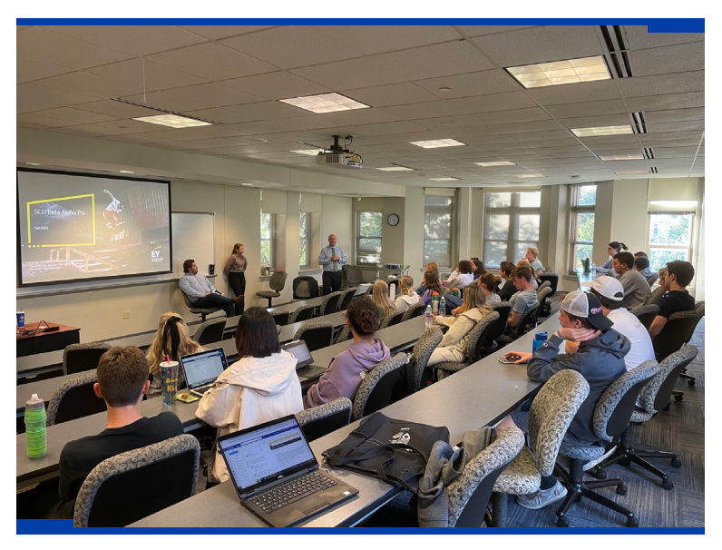
Beta Alpha Psi Meeting