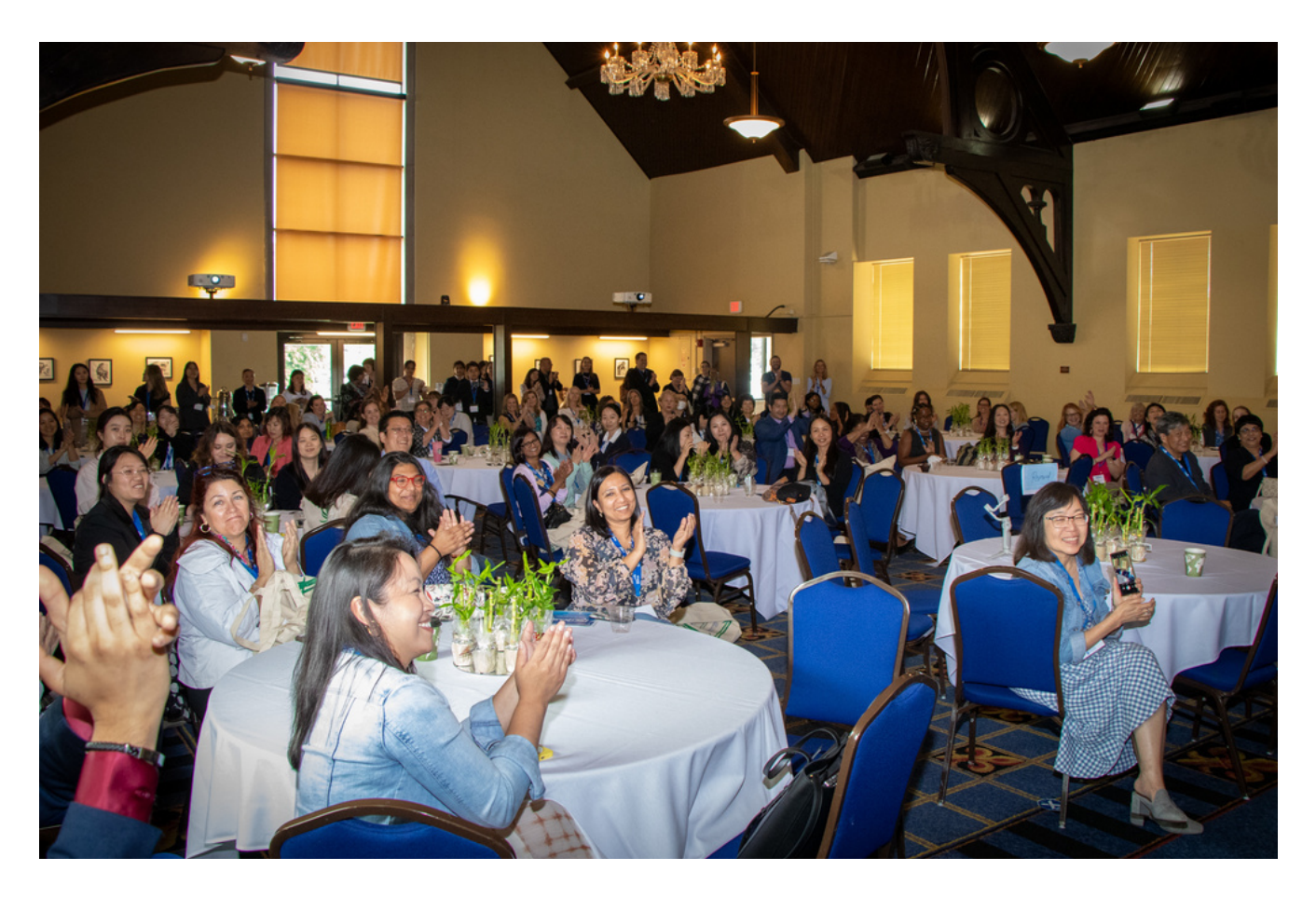
The 2024 Be Heard Conference was held May 3rd to kick off AAPI month, representing the first campus-wide AAPI celebration at Saint Louis University.