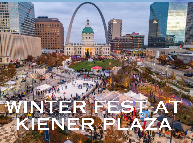
WINTER FEST AT KIENER PLAZA