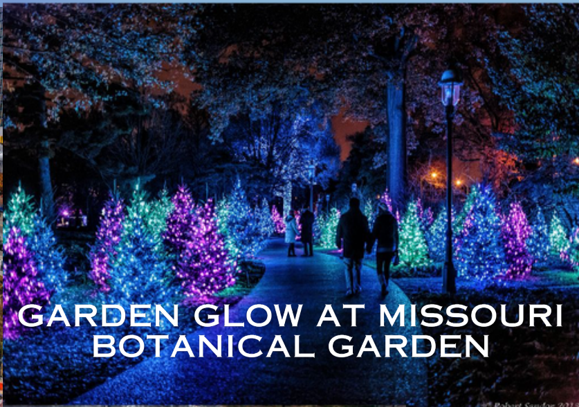
GARDEN GLOW AT MISSOURI BOTANICAL GARDEN