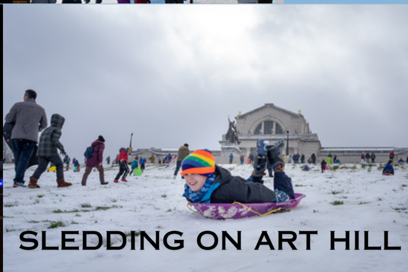
SLEDDING ON ART HILL