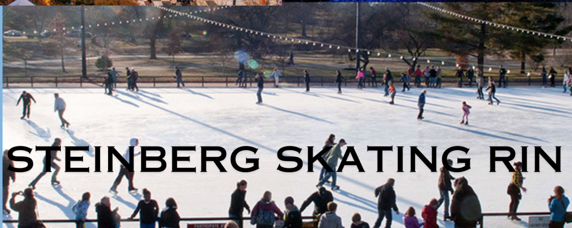
STEINBERG SKATING RINK