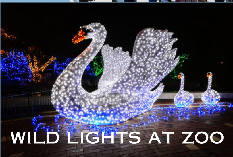
WILD LIGHTS AT ZOO