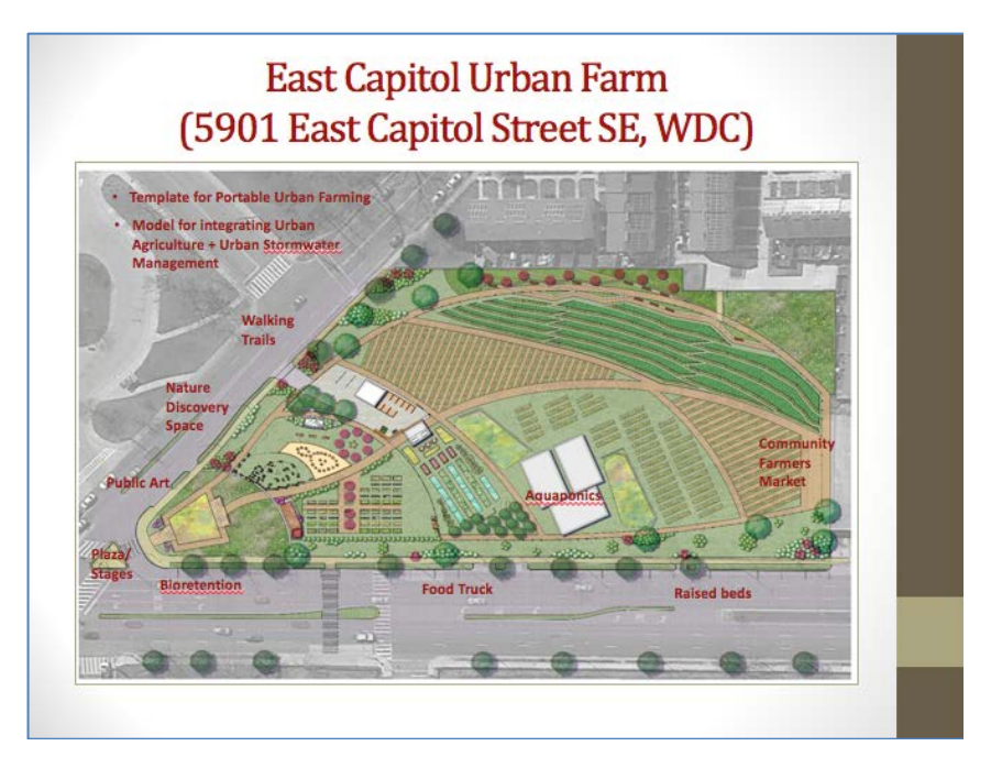
Figure 3: East Capitol Urban Farm (as built)

operated through a comprehensive plan for education, research, and capacity building. The ECUF would include aquaponics, walking trails, raised community gardening beds, a community-operated farmers market, integration of green infrastructure and urban agriculture, water efficiency strategies, a nature and discovery space for kids, a community plaza, and public art. <sup>28</sup> Overall, the ECUF would be a model for launching a food policy initiative as well as community development. Five "needs" guided or resulted from the ECUF and are explained in the following sections.