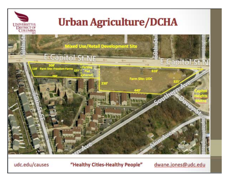
Figure 1: East Capitol Urban Farm (pre-development)

acres of land was available for temporary urban farming across the street from the planned Wal-Mart site (under construction at the time of planning the ECUF). Through a series of discussions, UDC and another entity were selected to "farm" the available land. UDC would farm the lower three acres of property adjacent to the Capitol Heights metro stop. Another entity would farm the upper two acres west of the UDC site. Together, these projects, each under a short-term lease of three years, would form the framework for community food access through the lens of urban agriculture. This article will focus only on UDC's efforts in developing the three acres of vacant property.