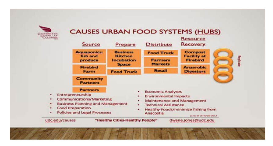
Figure 1: UDC-CAUSES Urban Food Hubs Model