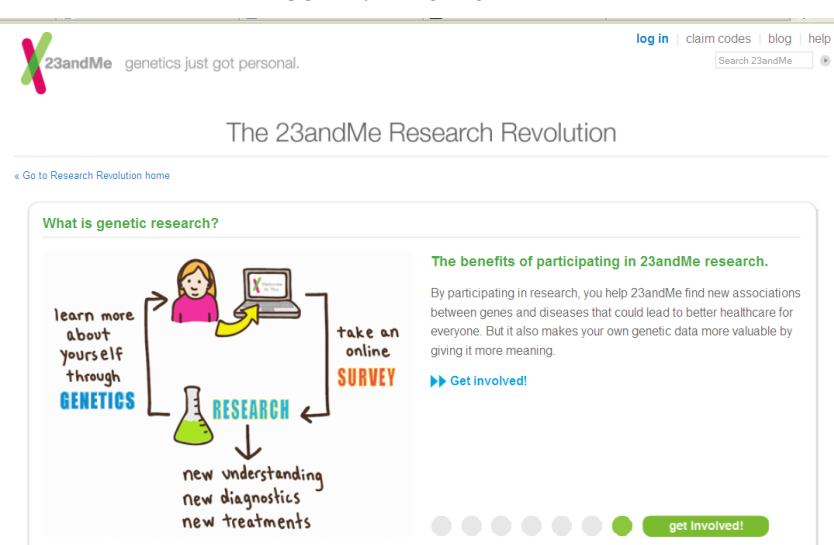
FIGURE 3. "RACE TO 1000"

An important ethical question prompted by these new formations is whether DTC genomic consumers may also be considered research subjects. If so, the next question is whether companies must fulfill the same responsibilities and obligations to their consumers as would be expected in traditional contexts of genomic research. Are consumers ongoing vested partners in the research activities of 23andMe or are they "altruists," who are donating their samples and genetic data for the potential benefit of general knowledge? What type of assurances are there that the anonymity of genetic information will be safeguarded against genetic technologies aimed at identifying increasingly specific genetic variation where individual identity may be inferred even when personal information has been de-linked from samples? What obligations does the company have to its consumers to inform them of the type of research being conducted using consumer samples?