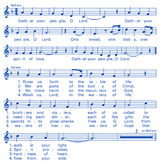
Text: Based on 1 Corinthians 12; Isaiah 2:3-4, 11:9. Text and music © 1991, Bob Hurd. Published by OCP Publications. All rights reserved.