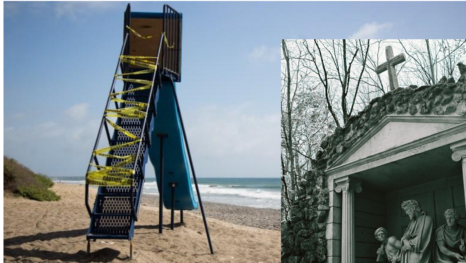
San Clemente Beach on April 2, 2020