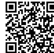
SLU Students for Life Pregnant and Parenting Student Assistance