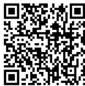
SLU Campus Kitchen