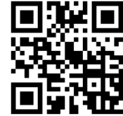
Healing Action: Serving Survivors of Sexual Exploitation