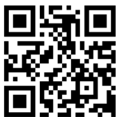
Missourians Against the Death Penalty

We invite you to explore some of the following organizations to discern how you are being called to honor the Resurrection by working for justice and reconciliation. While by no means an exhaustive list of justice organizations, we provide this as one resource to respond to the call of the Pope to work to see all as our siblings in Christ and work for justice, peace, and fraternity.