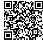
Casa de Salud