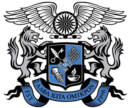
Alpha Iota Omicron *Asian - Interest Fraternity