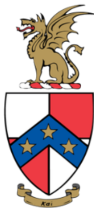
Beta Theta Pi