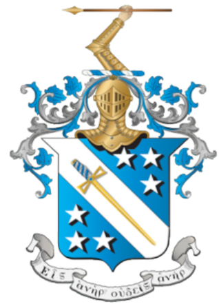
Phi Delta Theta