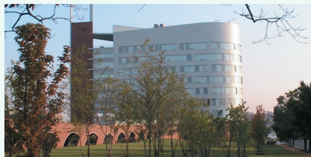
Represents a natural next step in the evolution of the University's long standing research tradition, all with the goal of making our world a healthier place.