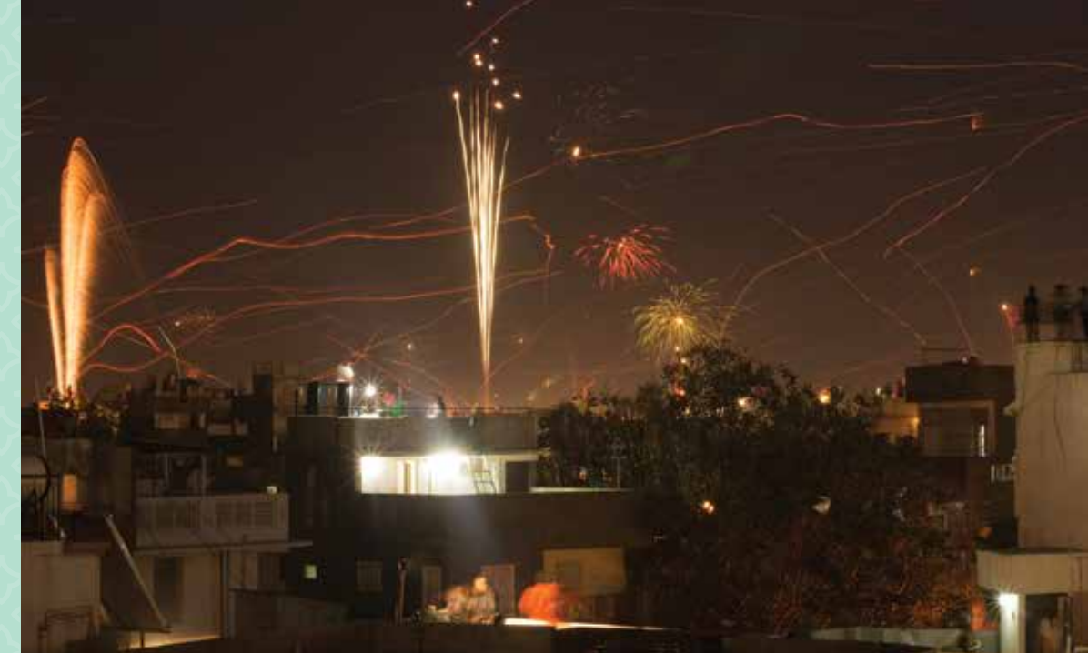
Fireworks in Baroda, Gujarat, India PHOTO BY NAMRATA PATEL, MASTER OF PUBLIC HEALTH IN GLOBAL HEALTH STUDENT AND WINNER OF THE 2017 STUDENT PHOTO CONTEST, CITYSCAPE CATEGORY.

Saint Louis University All rights reserved.