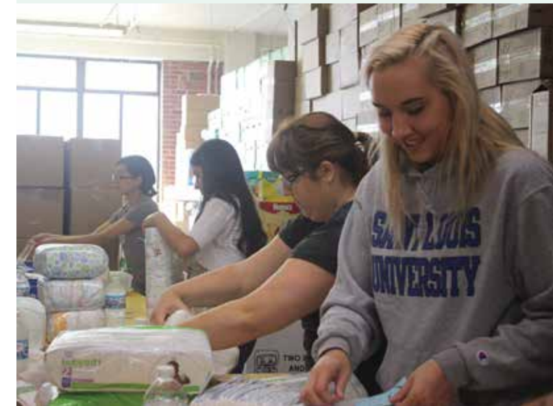
Students from the College for Public Health and Social Justice volunteered at the St. Louis Area Diaper Bank, a nonprofit that distributes nearly 30,000 diapers a month to organizations that help young families that lack the resources to purchase diapers.