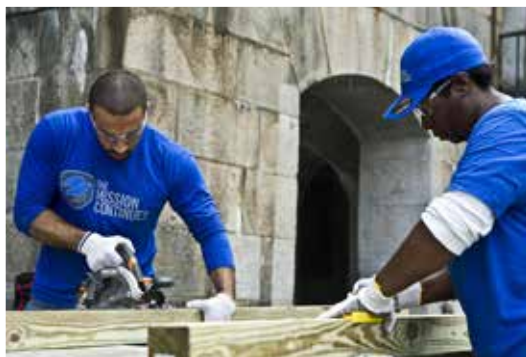
Veterans work on construction projects as they transition to civilian life. Through The Mission Continues, veterans transition to civilian life by volunteering on community service missions.

While all the veterans in the civic service program experienced improvements in health, mental health and social functioning, those who entered the program with existing mental health conditions like depression and PTSD showed the most significant improvements, (even after the researchers controlled for treatments they were already receiving.)